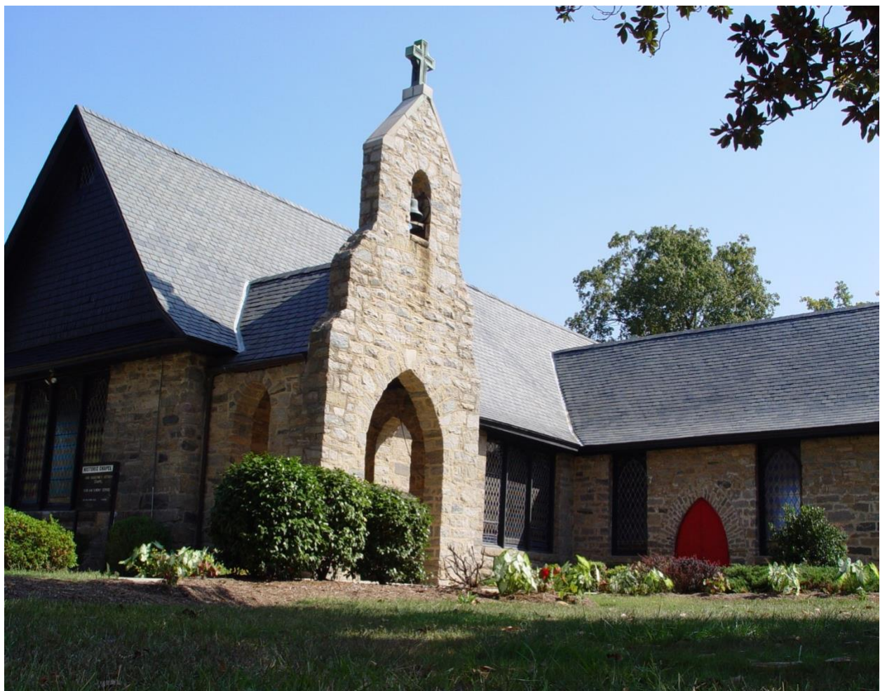
Saint Augustine's Chapel – 1411 Oakwood Avenue, Raleigh, NC 27610

Pastoral and Professional Counselors: According to the Clery Act, pastoral and professional counselors who are appropriately credentialed and hired by Saint Augustine's University to serve in a counseling role are not considered Campus Security Authorities when they are acting in a counseling role. These individuals will aid in filing reports with the Police or Title IX if desired. Confidential reports made to professional counselors or pastoral counselors are not disclosed in the Annual Security Report.