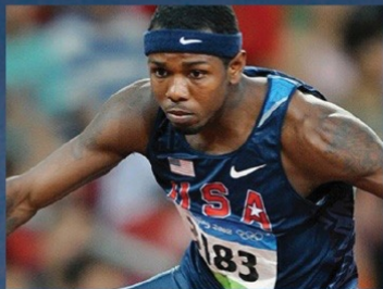
Bershawn D. "Batman" Jackson Olympic Bronze Medalist, USA Track & Field.