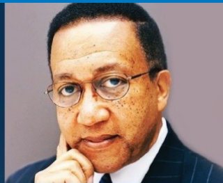
Dr. Benjamin Franklin Chavis Jr., Civil Rights Leader