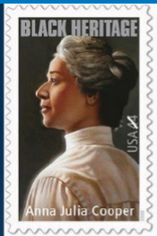
Dr. Anna Julia Cooper 1858 – 1964

An author and university President. Born a slave, the 4th black woman to earn a Ph.D.